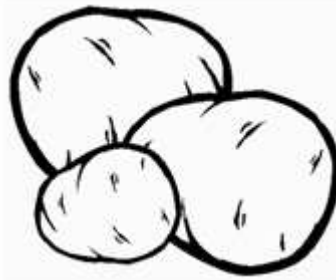
POMMES DE TERRE