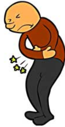
SE TORDRE DE DOULEUR