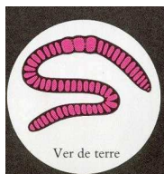
Ver de terre